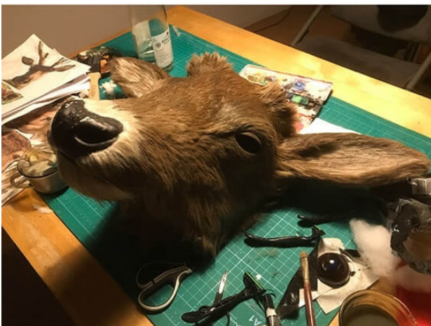
Different stages of the stag head. Starting with the first clay model through the resin cast to the final and finished head with fur on the set.